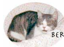
BERT & ERNIE